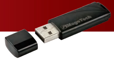
iMage Dongle Overall Feature Description

Plug and Play iMage Dongle, and it can quickly be done without the assistance of professional IT staff. iMage Dongle Helps you connect iMage A6 to computer via wireless. With its exclusive antenna design, it does not conflict with other wireless devices. It works under low power consumption and supports wireless audio transmission, which completely solve the problem of unstable connection between computer and audio device via wireless. After connecting with iMage A6 (optional), it can be expanded to 2 iMage A6, to quickly build a small to medium-sized conference environment for 6-12 people. Suitable for placement in small and medium-sized conference rooms, no longer limited by the configuration of the conference room.